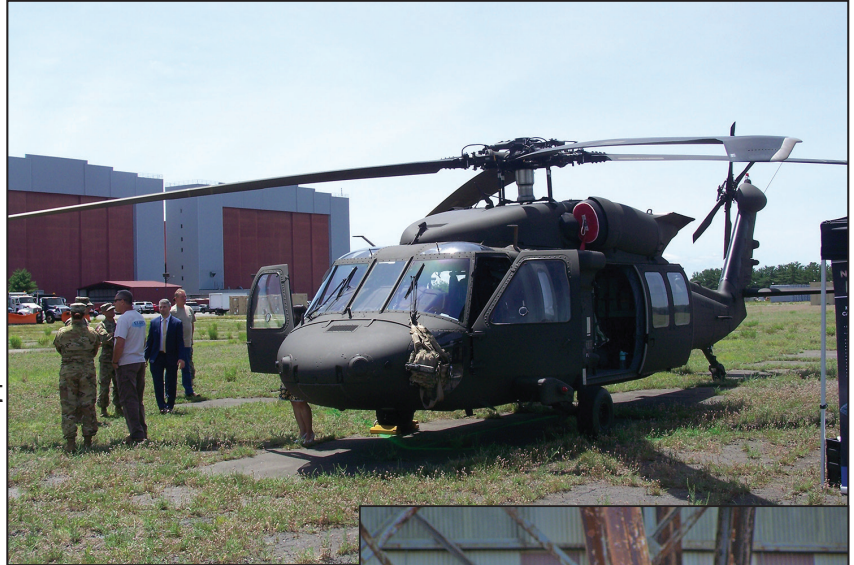
Attendees examine one of the helicopters that was present just for the event.